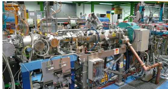
Figure 2: RFQ at final position (centre) and beam diagnostics test bench for RFQ commissioning (left).

Commissioning of LEBT and ion sources was finished by CNAO successfully in January 2009. Design ion beam currents and emittances were reached [1][2][3]. The correct matching conditions at the position of the RFQ entrance were checked by beam emittance measurements.